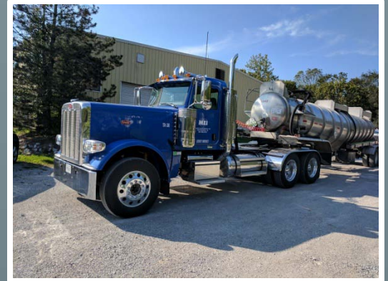
Peterbilt 389 Glider with a C-15

Candles are a great way to give a room that warm glow, but they can also cause fires. According to the National Candle Association , almost 10,000 home fires start with improper candle use. Never leave candles burning if you go out or go to sleep, and keep your candles away from pets and kids.