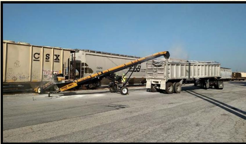
MEI Grain Mover

The restart changes in the hours-of-service rule in 2013 have been analyzed by the American Transportation Research Institute (ATRI) for safety and operational impacts from the 34-hour restart provision. It had been argued that the rule would mean putting more trucks on the road during peak morning traffic periods, and the research provides statistical evidence to back up this claim. After analyzing the truck GPS data, ATRI found the traffic has shifted from night and weekends to day causing more congestion during weekdays. The crash data analysis also showed a statistically significant increase in truck crashes after the July 1, 2013 rule change, specifically with injury and tow-away crashes. Dean Newell, a member of ATRI's research Advisory Committee said, "After many years of crash decreases, everyone knows our industry has experienced an uptick in crashes. This latest analysis from ATRI confirms both changes in operations and crash risk that seem associated with the restart rule. Regulations should serve to improve safety, not create additional safety risks."