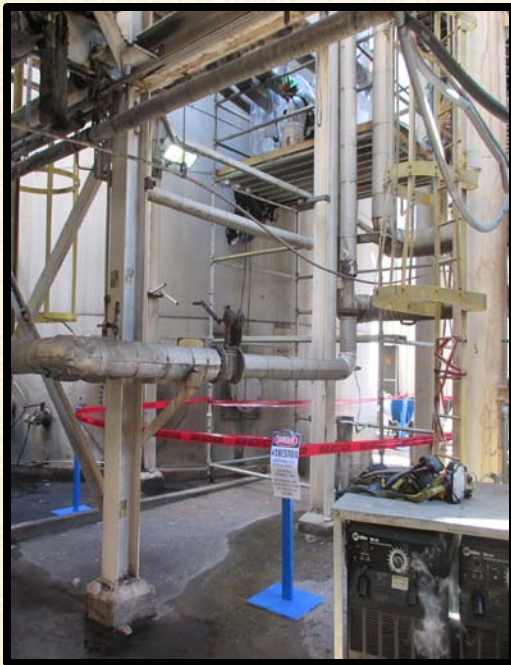
Barricaded Area Around Scissor Lift