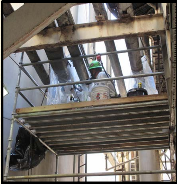
Glove Bagging Asbestos Containing Pipe Insulation