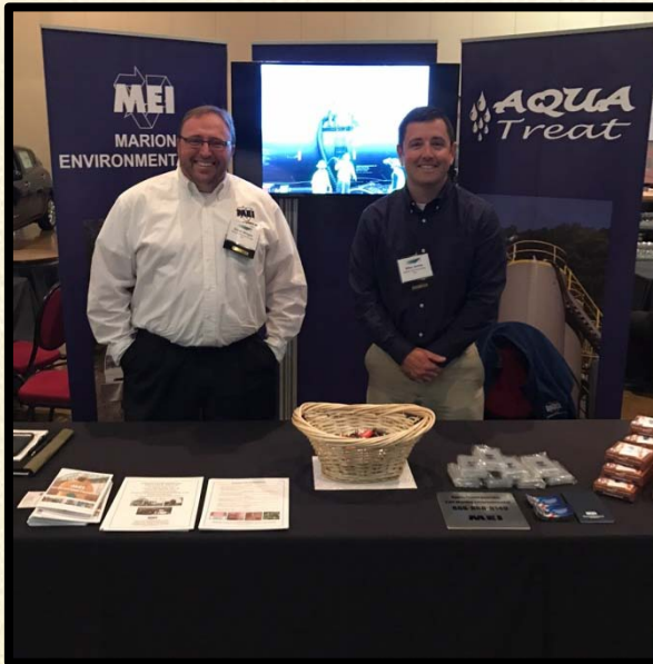
Environmental Show of the South