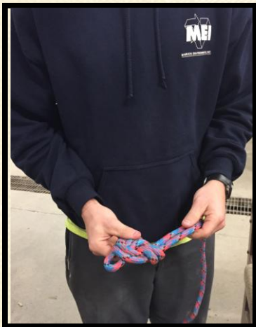
Figure 8 on a bight

Training for confined space rescue is multifaceted, but a large part of the rescue procedures involves ropes and applicable knots for specific rescues. Marion encourages our technicians to practice tying knots in order to keep their ability sharp. The skill is not one that is used every day on the job site, but when an emergency happens, it can be a vital and necessary skill to have.