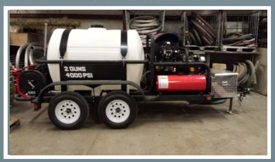
Hot Pressure Washer